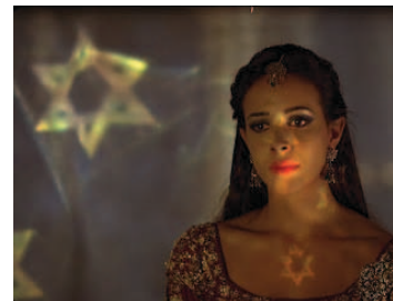
[MOVIE NIGHT: see page 8]