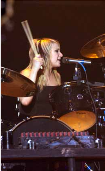
Jen Ledger of Skillet