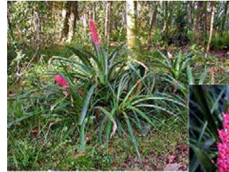
Aechmea 'Lyman Smith'

This month I am ordering several loads of mulch from GRU - time to work off that Christmas dinner! If you are willing to help spread it out - even on your birthday, contact me or the church office and I'll make sure you are notified when we have our mulch movers' party. The mulch could arrive anytime during the next three months - whenever the GRU crews are clearing power lines on this side of Gainesville.