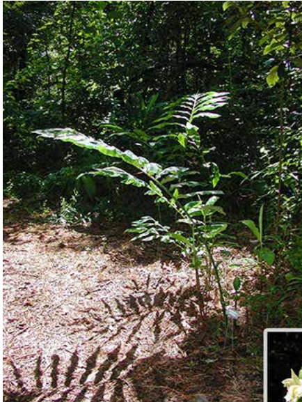
Pine Cone Ginger