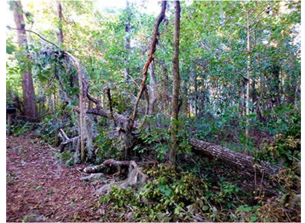
Hurricane Hermine damage

Seed pods will be forming on the strawberry bush plants ( Euonymus americanus ) and beautyberry bushes ( Callicarpa americana ). The firespike plant ( Odontonema strictum ) near the big live oak tree ( Quercus virginiana ) may start blooming toward the middle of the month, with spikes of red flowers on it.