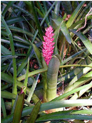
Aechmea 'Lyman Smith'

Soon we will be experiencing cooler temperatures, shorter days, and the last bursts of flowers of this year. Continuing to bloom from last month are the bromeliads ( Aechmea 'Lyman Smith').